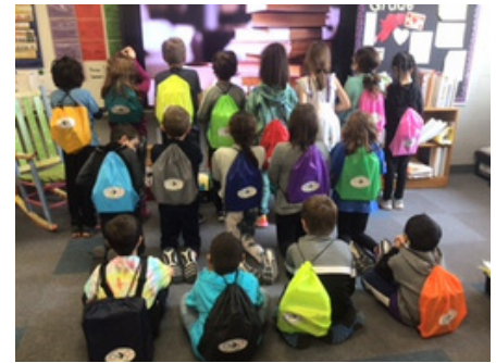
Hill Huskies carrying books for Drop Everything and Read

Each building determined how the Troy Youth Assistance resources could be meaningfully allocated to positively impact the school community. Some investment of funds included purchasing consumable materials for service-learning projects throughout the community, contributing to March Is Reading Month shared experiences for each child to receive the same book, and partnerships with social emotional learning programs to name a few. Participants expressed gratitude for the opportunity to allocate resources targeted toward enhancing the focus on equity and sense of belonging of all members of their school community.