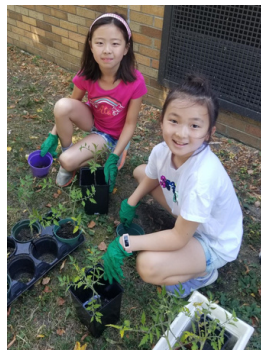
Children at Summer Camp in Troy

Our Camp/Skill Building program was developed to help youth benefit from positive learning experiences designed to enhance self-esteem or develop a specific skill. For the 2021-22 school year, financial assistance was awarded to 28 children ages 7-17 years old to attend programs such as soccer, football, baseball, karate, an 8th grade field trip, tutoring, and summer camps. Scholarships ranged from $80 to $300. Per Troy Youth Assistance policy, parents were required to pay part of the cost, as well as meet financial requirements.