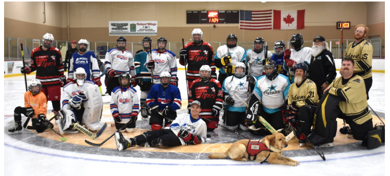
Hockey Mentors for Special Olympians Event, June 11, 2022